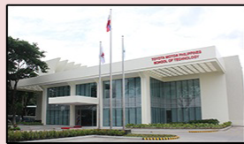
TOYOTA MOTOR PHILIPPINES SCHOOL OF TECHNOLOGY